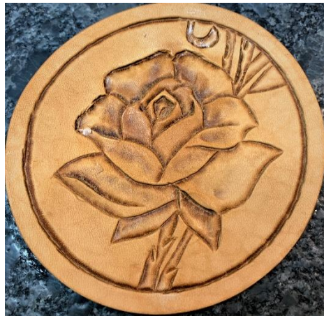
08 Inverted Style Beveling Completed