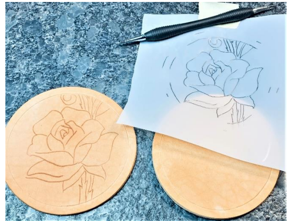
02 Traced Pattern & Transfer to Leather with Borders Marked