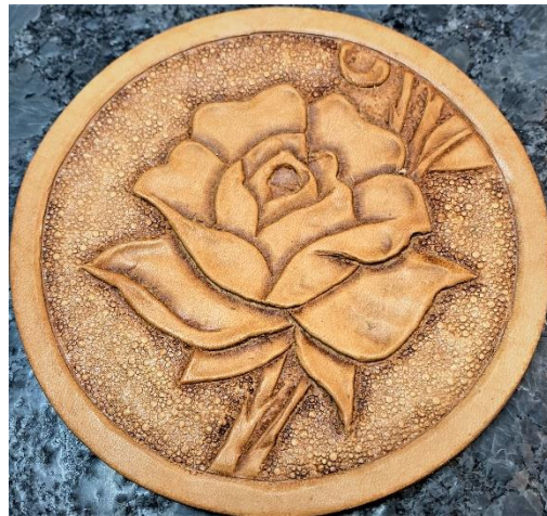
10 Traditional Style with Background