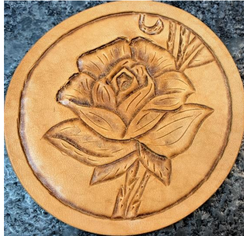
09 Completed Inverted Style Rose Coaster

14. You can now add color to your roses.