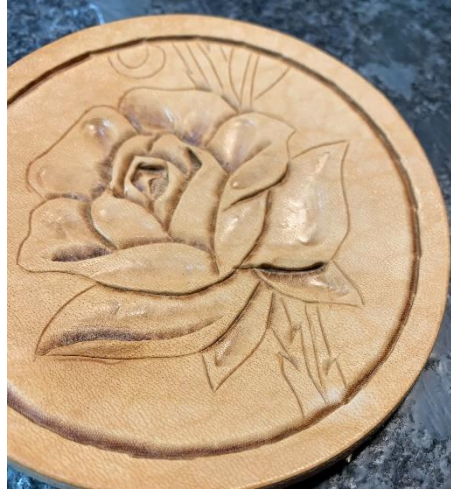
06 Interior Beveling, Traditional and Inverted