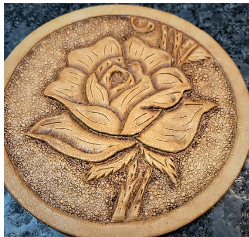
11 Traditional Style Rose Coaster Completed