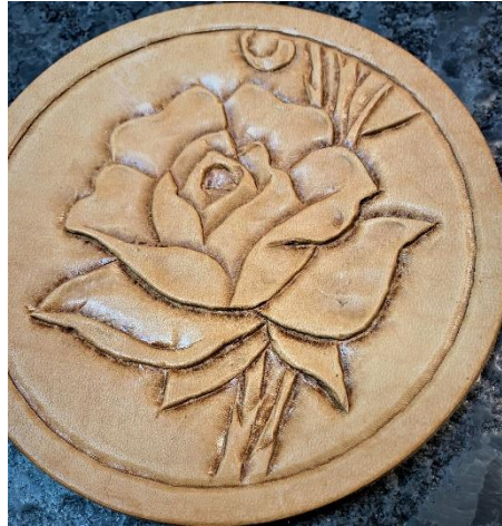
07 Traditional Beveling Completed