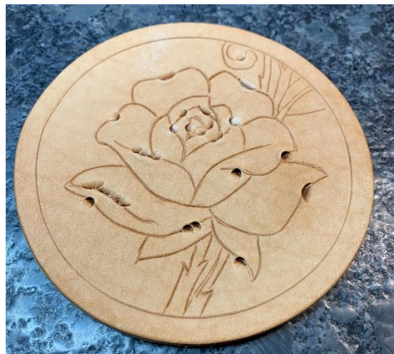
04 Use of Undercut Bevelers after Swivel Knife