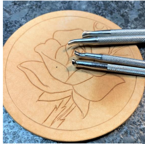
03 Undercut Bevelers

Since the difference between the two styles only relates to the outermost pattern lines, the interior of the rose and leaves are beveled the same in both styles (Photo 06).