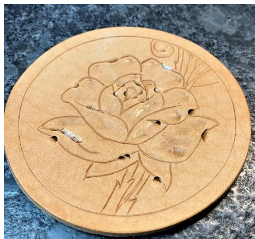
05 Pear Shader Applied