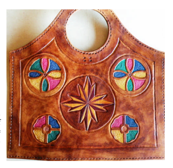
Photo 4 : Dyed and finished main section of the Market Bag. Different shades of brown are used to accent the 3-D effects of the compass, while primary colors add "pop" to the Bag in the smaller geometric designs.

The final stage of the process is assembly. For this bag, the process involves attaching the hardware, adding decorative lacing, then lacing six separate pieces together and attaching a shoulder strap. The following photos show the final product from a variety of angles.