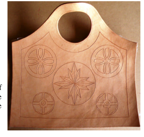
Photo 2 (right): One side of the purse cut out with the design laid out on the